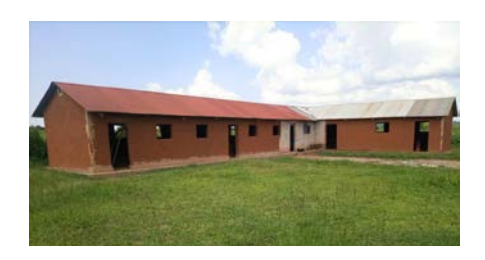
from crumbling classrooms